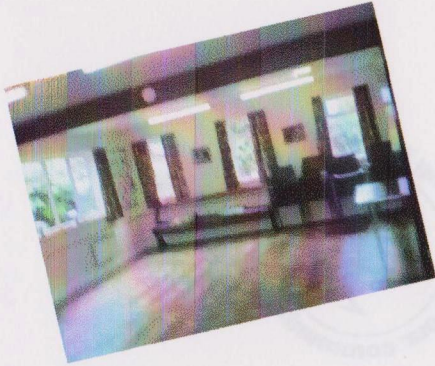
Inside the Bangay room